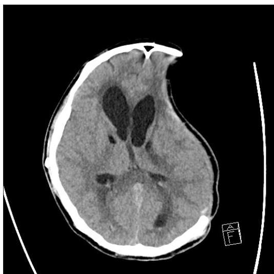
Fig. 1. Preoperative brain computerized tomography shows marked shrinkage of left cerebral hemisphere, markedly increased ventricular size and scant amount of intraventricular hemorrhage.

He went into a coma and showed partial spastic movement of extremities, suggesting a sudden increase in intracranial pres-