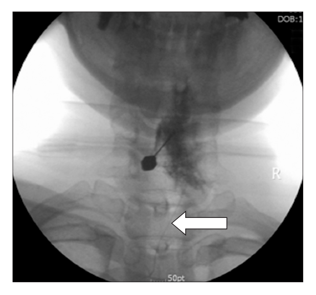
Fig. 1. Fluoroscopy during cervical epidural block. Racz catheter fragment seen at the cervical spine level.

months later, with the same symptoms and again received the paravertebral block at the T2 level. Two weeks later, she still had a pain score of 4 to 6-points on NRS. Findings in the cervical spine magnetic resonance imaging (MRI) showed broad central disc protrusion at the C5-6 and C6-7 levels. Two weeks later, cervical Racz neuroplasty was done, and on the next day, after infusion of hypertonic saline through the Racz catheter for 30 minutes, the catheter was removed with no side effects. Two months later, the patient visited the outpatient department with a new symptom. She complained of a tingling sensation on her right arm, without pain in the neck or arm, which subsided after receiving physical therapy and medications. The patient conse-