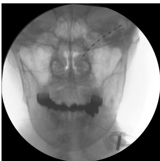
Fig. 1. This fluoroscopic image is an intraoperative fluoroscopic image after the occipital nerve stimulation trial.