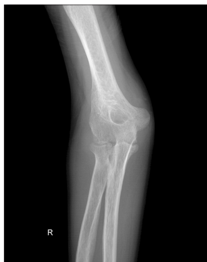
Fig. 2. Anteroposterior X-ray of the right elbow shows diffuse joint space narrowing, multiple marginal and central bone erosions, a significant amount of joint effusion, and slight periarticular osteoporosis.