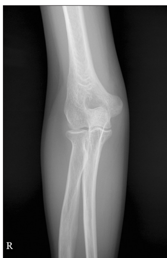
Fig. 1. Anteroposterior X-ray of the right elbow shows no significant abnormalities.

Three months later, the symptoms became severe and the patient re-visited the clinic. On physical examination, there was severe limitation in elbow flexion and extension, and local warmth and swelling in the right elbow. Under the